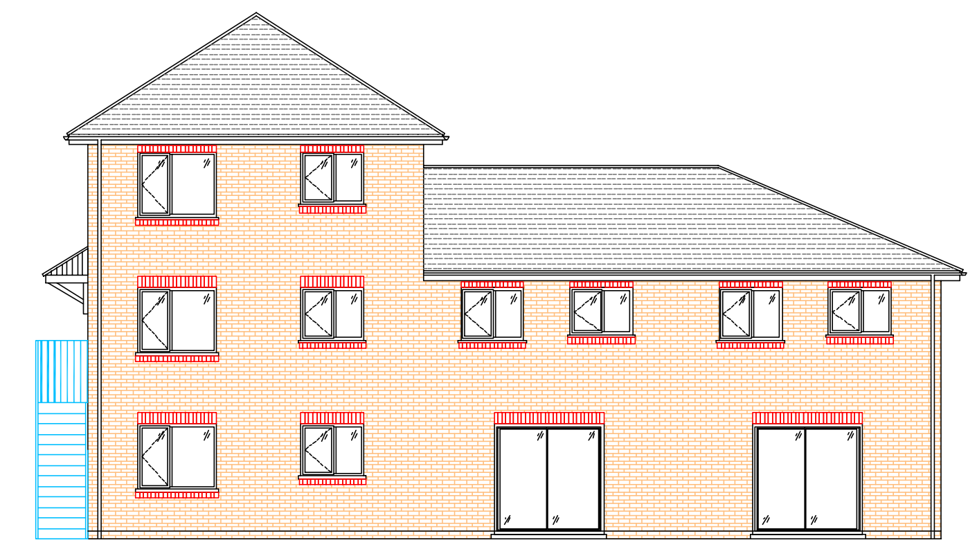
REAR ELEVATION - VIEW C