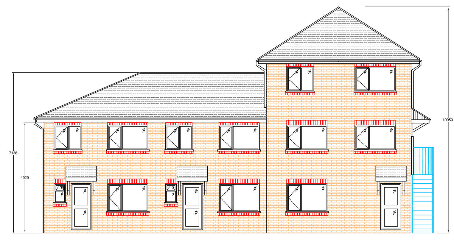
FRONT ELEVATION - VIEW A